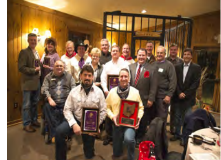
Honorees and presenters at PACC Western Roundup